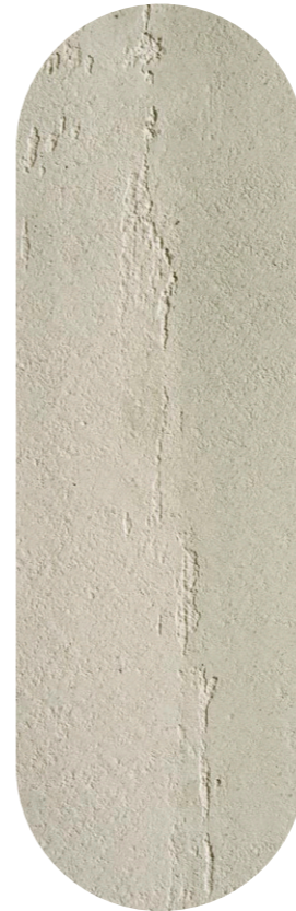
Archi+ Concrete MKS 20140 & MKS 20151