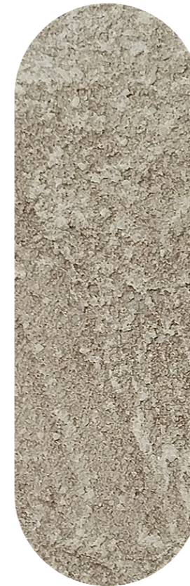
Concrete 4654 PC 2010, FS 6101, FS 6110