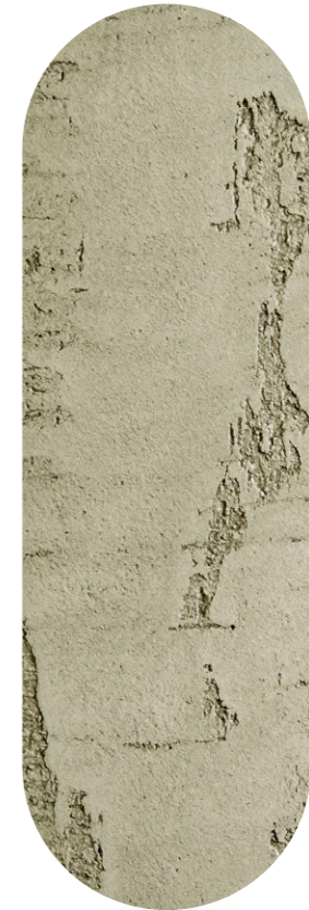
Archi+ Concrete MKS 20152, Fase Silossanica 6101

IT. Intonachino di calce in polvere ad “effetto cemento”