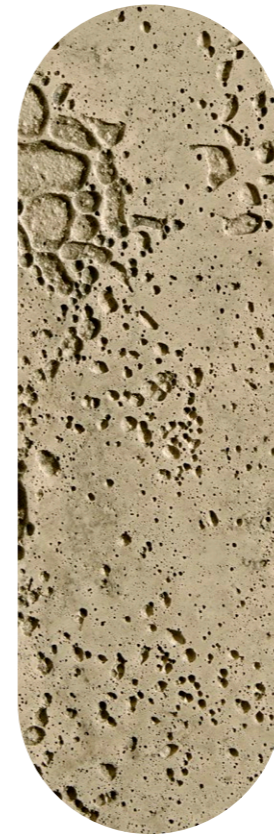
Archi+ Concrete MM010, Fase Silossanica 6100