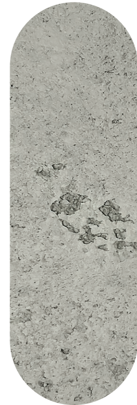
Archi+ Big MKS 15128, Fase Silossanica 6100

IT. Intonachino di calce in polvere per interni, a grana grossa, ad effetto cemento