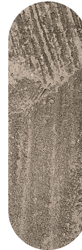
Concrete 17007, FS 6112