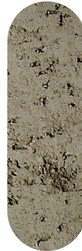
Archi+ Big MM018, Fase Silossanica 6100