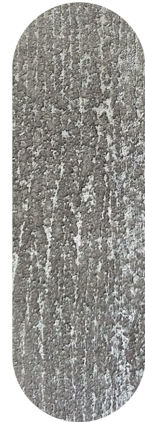
Concrete 4654 PC 2010, FS 6101, R-Stone Metal Silver

IT. Intonachino acril-silossanico fine per esterni, antialga